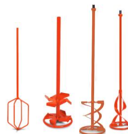
RUBI® mixing paddles range.