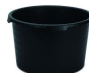
RUBIMIX Buckets Ref. 60202 y 60265